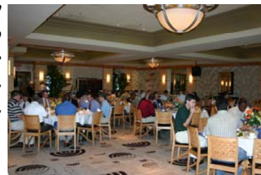
Conference participants enjoy lunch and catch up on biomass related issues

woody biomass, sustainable development and the